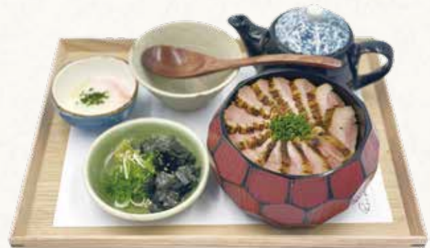
Special Roasted Duck HITSUMABUSHI

slow cooked roasted sliced duck, furikakenori w/ special BBQ sauce on rice, wasabi, nori, sesame, negi, soft boiled egg & dashi soup for cha-zuke