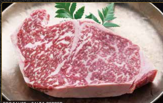
BBQ SAUCE or SALT & PEPPER

the prime tender fillet, best for those watching their waistlines. we serve the tenderest part for the chateaubriand.