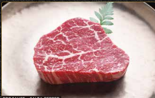
BBQ SAUCE or SALT & PEPPER