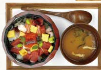
Kaisen Chirashi Don