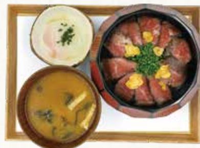
Premium Wagyu Beef Don