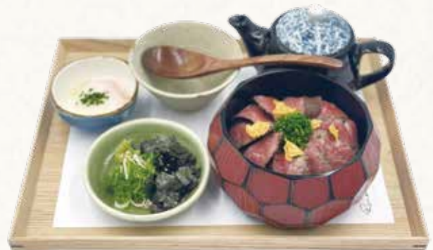
Premium Wagyu Beef HITSUMABUSHI

slow cooked 9+ wagyu beef w/ special BBQ sauce, garlic chips on rice, wasabi, nori, sesame, negi, soft boiled egg & dashi soup for cha-zuke