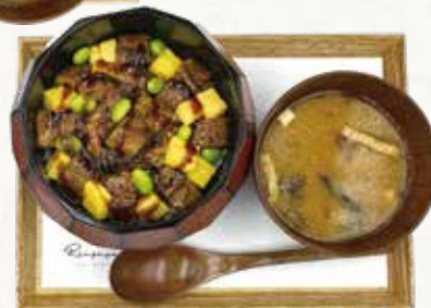
Premium Unagi Teriyaki Don