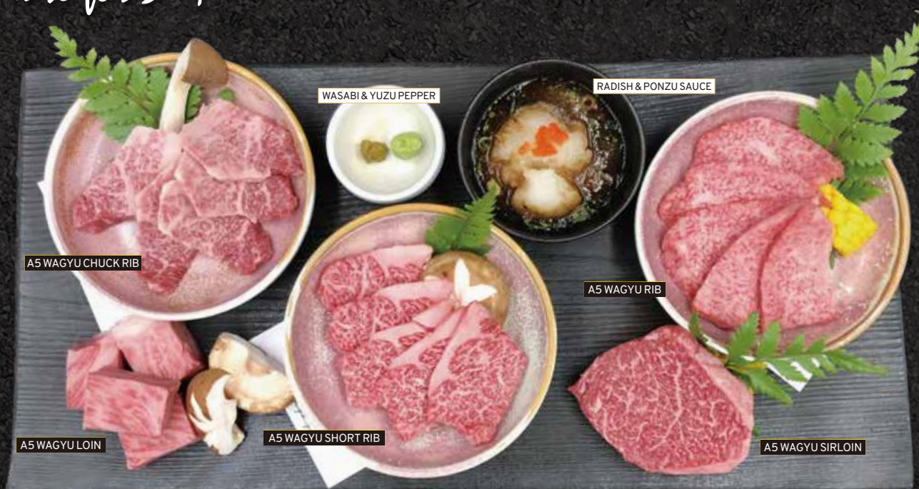
Plate for 3-4

Rengaya uses only A5 Grade “Kagoshima Beef”