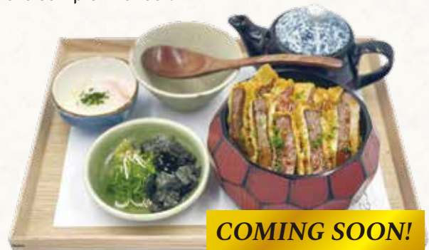
Wagyu Beef Katsu HITSUMABUSHI

deep fried wagyu beef cutlet w/ homemade katsu sauce, furikakenori on rice, wasabi, nori, sesame, negi, soft boiled egg & dashi soup for cha-zuke