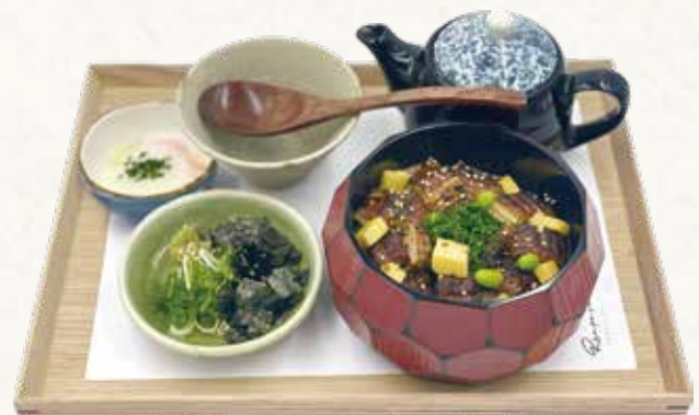
Premium Unagi HITSUMABUSHI

Japanese grilled teriyaki eel w/ teriyaki unagi sauce, edamame, omelet on rice, wasabi, nori, sesame, negi, soft boiled egg & dashi soup for cha-zuke