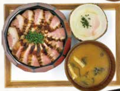
Special Roasted Duck Don