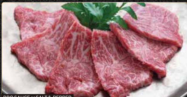
BBQ SAUCE or SALT & PEPPER

prime cut of rib, fully marbled. rarity of this cut makes it very popular.