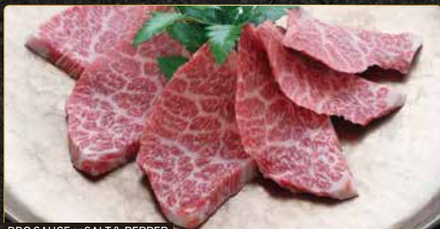
BBQ SAUCE or SALT & PEPPER

very rare meat that can be taken only from the well - grown arm.